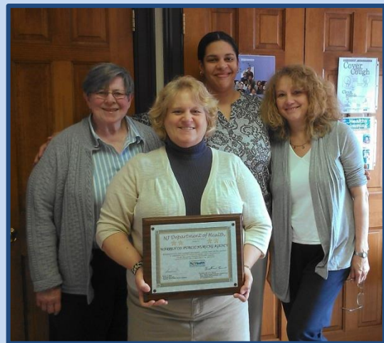
PHNA Staff pose with the NJDOH Service Award for Best Vaccination Practices

On September 25, 2013, the Public Health Nursing Agency was honored with a Service Award from the NJ Department of Health for Best Vaccination Practices. The award was given to recognize the agencies unwavering commitment to safe administration, handling, and storage of vaccines, as well as high coverage rates.