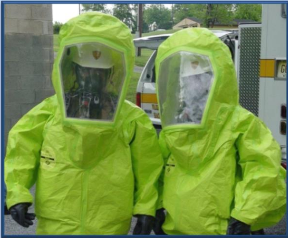
HazMat responders in Level A protective suits

The Hazardous Materials Response team is managed by the health department and staffed by volunteers. In conjunction with local law enforcement agencies, fire departments, and rescue squads, the WC HazMat Team responds to hazardous material emergencies, like fuel spills or other chemical leaks, throughout the county.