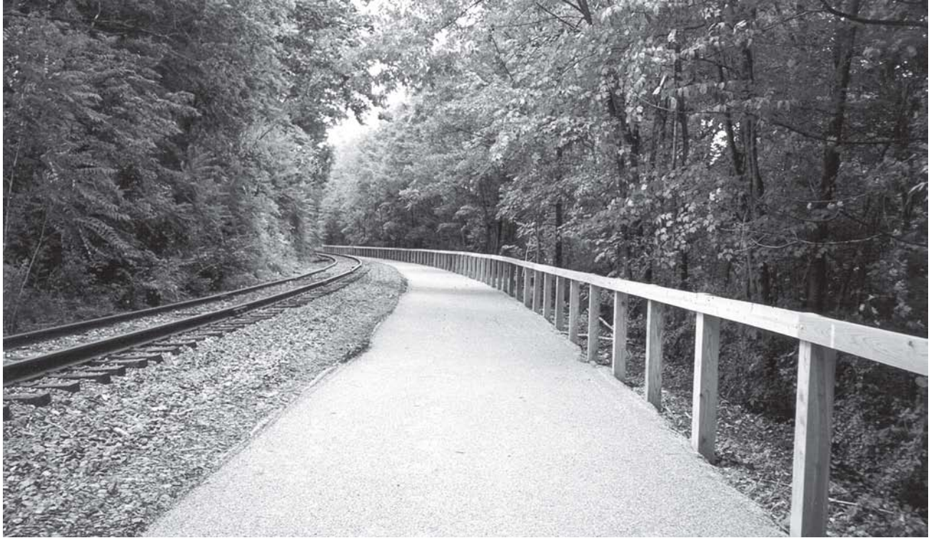
Sixty-one rails-with-trails now operate safely in the United States. For more information, see RAILS-WITH-TRAILS , by Rails-to-Trails Conservancy.