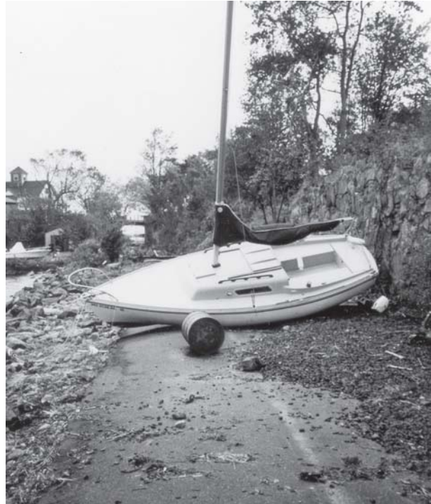
A good management plan will allow for detection and warning of non-permanent hazards. (David Burwell)

The recreational use statutes appear to be “working” in the sense that they are limiting liability to the extent that was intended. In addition to recreational use statutes, some states have special statutes limiting liability that may be applicable. Pennsylvania, for example, has a specific trails statute (Act 32 P.S. §§ 5621 et seq.) which limits liability for landowners who allow their land to be used for trails, trail owners, and adjacent property owners with protections similar to a recreational use statute.