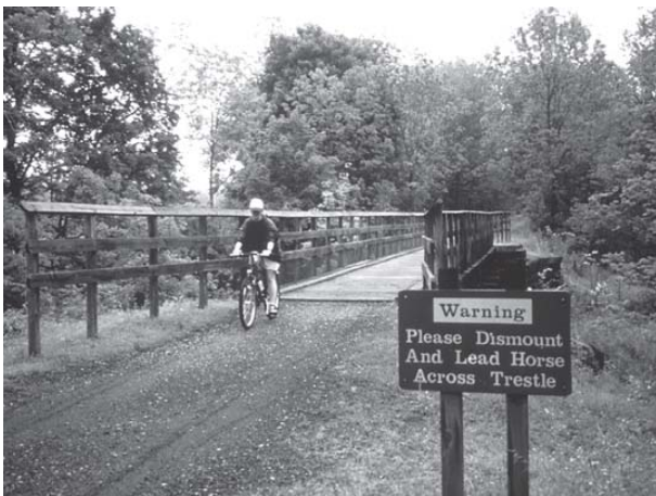
Trail managers cite warning signs as a good risk management technique.

The managing agency should also develop a comprehensive maintenance plan that provides for regular maintenance and inspection. These procedures should be spelled out in detail in a trail management handbook and a record should be kept of each inspection including what was discovered and any corrective action taken. The trail manager should attempt to warn of or eliminate any hazardous situations before an injury occurs. Private landowners that provide public easements for a trail should ensure that such management