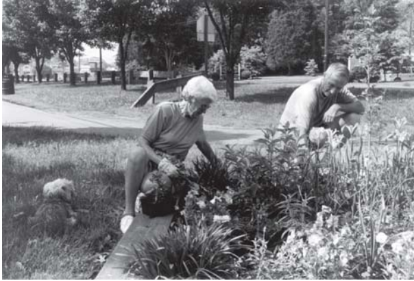
Using volunteers is a great way to keep your trail operating smoothly and create a feeling of community ownership. (Dave Dionne)