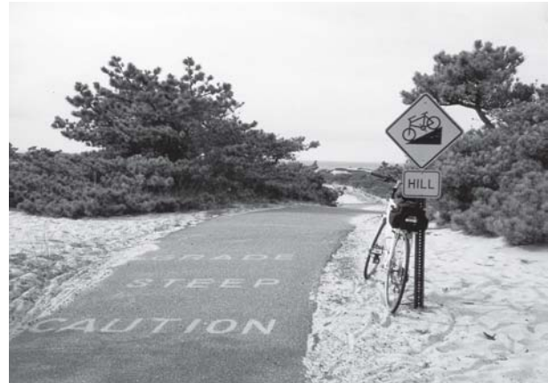
Warning signs help minimize the threat of liability. (John McDermott)

Questions related to legal liability for accidents or injuries on or adjacent to trails must be answered in terms of state common (judge-made) law, 2 which varies from state to state. The following discussion provides a broad overview of trail